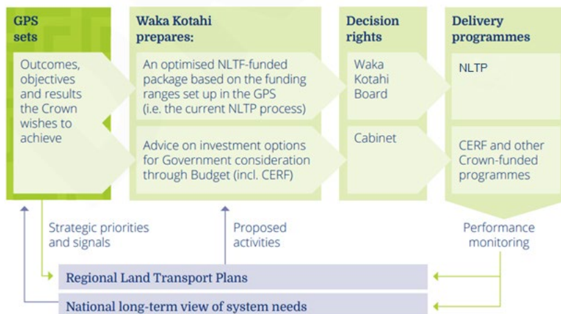
Figure 2. All eligible activities assessed using the IPM whether NLTF or Crown funded

In response to the draft GPS, and as part of the development of the NLTP, we propose that the IPM will be applied to all activities proposed for inclusion in the NLTP – regardless of whether they are to be funded out of the NLTF or recommended for direct Crown funding.