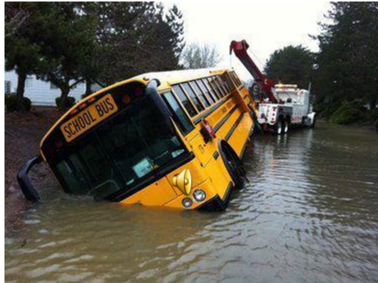
Captain Francesco Schettino's first day as a school bus driver