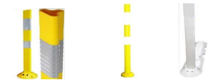
Figure 6: delineator posts (L to R): T-profile, tubular, 'flag' panel with cycle logo (TCD Manual Fig 2-28, 2-29)

Delineator posts (including the products known as "flexi-posts") are often used for separation or in conjunction with another element. They are usually to supplement a road marking.