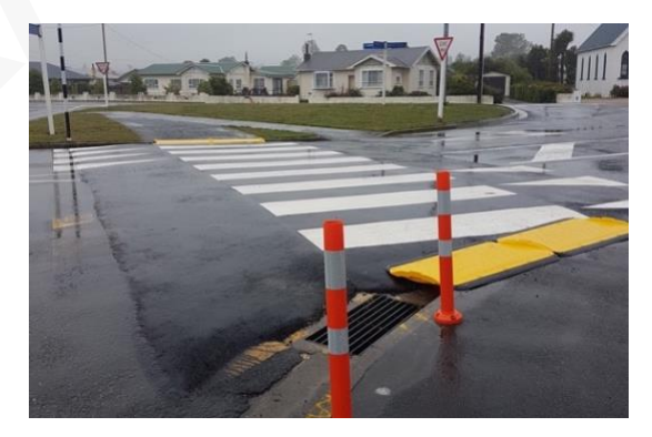
Figure 26: temporary asphalt zebra platform with 1:20 gradient, Takaka (P. Kortegast)