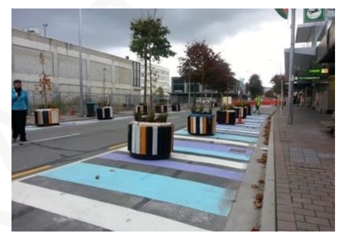
Figure 12: concrete barrel planters used for delineation, narrowing the carriageway, Christchurch (G. Dioni)