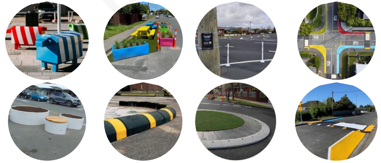
Figure 2: examples of materials used in non-permanent pilot projects

Examples of materials used in non-permanent projects are shown in Figure 2. A longer list of materials for demonstration events and interim pilots may be found on pages 87 and 92 of the Tactical Urbanism Handbook.