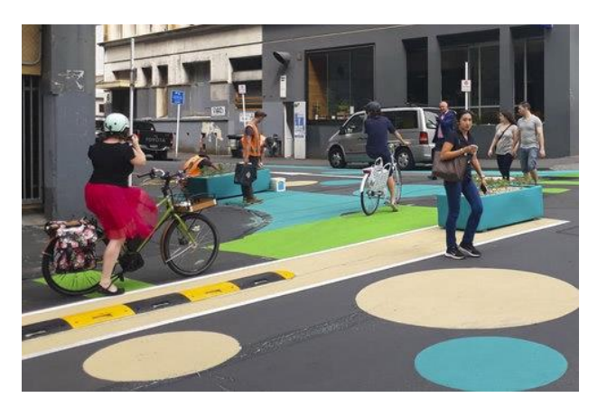
Figure 13: rubber speed humps, paint and plastic planter boxes delineate space, Auckland

If used for the purposes of slowing traffic, the installation must be illuminated or have reflective delineators or reflective signs installed so that the structure is visible.