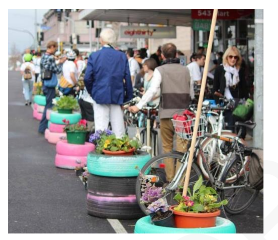
Figure 11: tyre barrel planters used for delineation, Karangahape Road, Auckland (Resilio)

Precast concrete materials can be designed as planters or seating. Concrete or wooden barrels are suitable for painting, but keep in mind that concrete may absorb a lot of primer paint. Stacked tyres can also be painted to add colour to a space, and are easily relocated. If plantings are included, talk to an arborist or landscape architect about means of addressing watering needs. Refer to section 2.2 regarding surface attachment considerations.