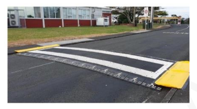
Figure 23: a platform with fillers at the kerb; markings not compliant with TCD Rule (O. McLean)

Asphalt can be an economical way to achieve a speed cushion or platform (Figure 26) and may be applied directly on existing road surfaces, although an experienced contractor is needed to form a consistent and correct ramp gradient.