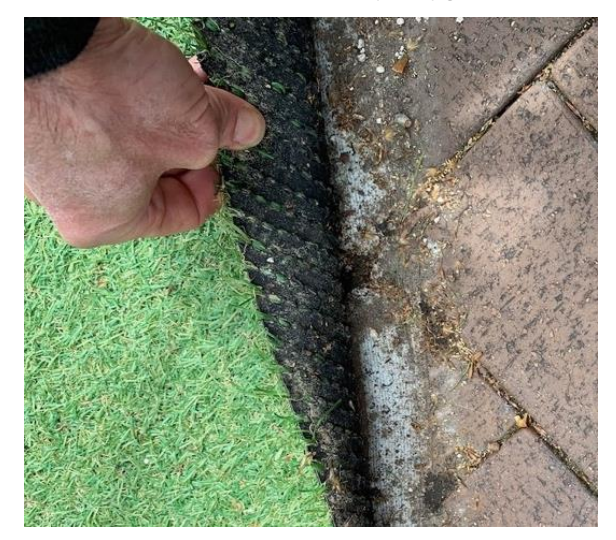
Figure 34: not all edges are traversed by pedestrians glue may be sufficient, Nelson

Figure 32: synthetic turf transforms a former vehicular space into a central city playground, Nelson