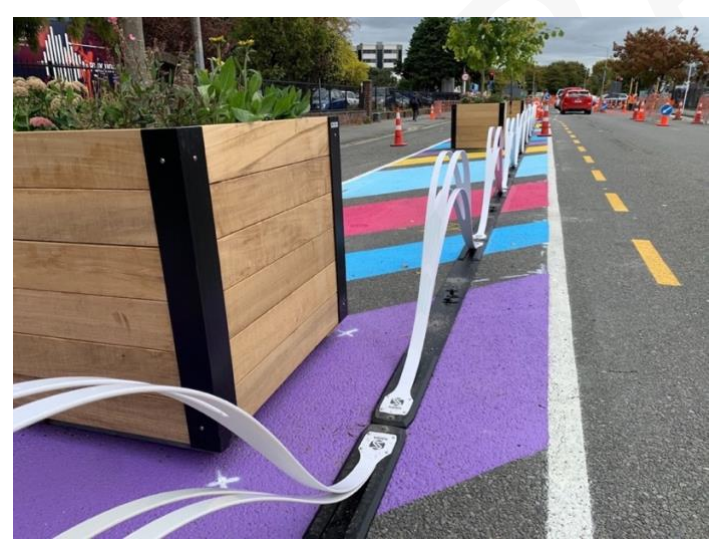
Figure 16: a 700 mm high flexible white plastic "wave" delineator, Christchurch (J. Lieswyn)