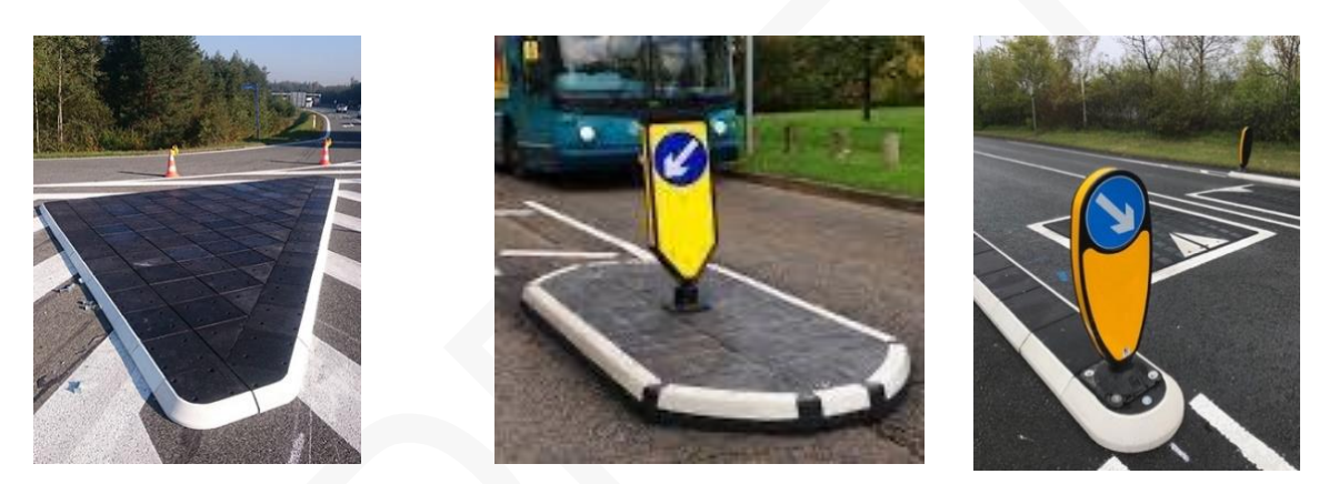
Figure 21: traffic islands made of interlocking rubber elements (left, centre) and separator kerbed islands with speed cushions (right)