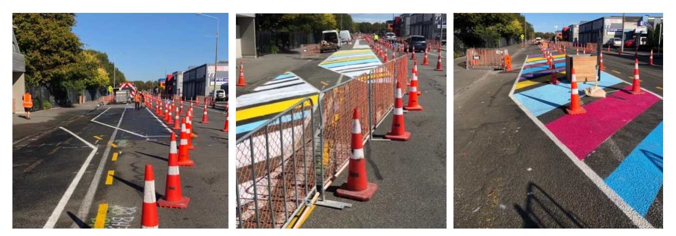
Figure 30: clean the surface, apply white primer, finish coat. Standard paint with grit mixed in is used as the surface is not going to be trafficked, Christchurch

There are other surface treatments such as synthetic turf that can define spaces. Turf needs to be fixed down so that the edge does not present a trip hazard. Glue and carpet nails or screws are common methods, depending on the surface type and condition. In some cases a strip along the edge can be screwed down to prevent uplift. Sand is often applied to permanent synthetic turf surfaces, but this may be undesirable if there is an intention to re-use the turf elsewhere or to minimise clean-up effort during removal.