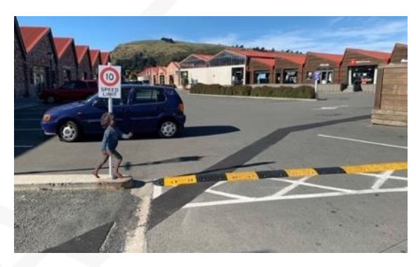
Figure 24: rubber speed hump and child crossing figure; speed limit sign non-compliant (J. Lieswyn)