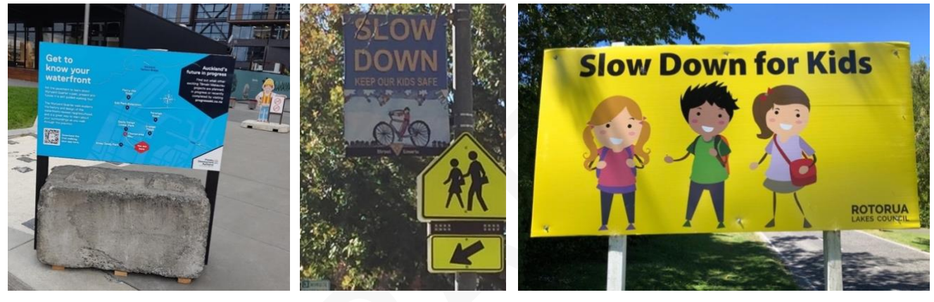
Figure 27: project information board, Auckland

Consult the <u>Advertising guidelines</u> (Waka Kotahi NZ Transport Agency 2019) for more information on creating an effective campaign.