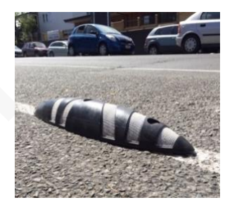
Figure 15: armadillo cycle lane delineator (ViaStrada)

Continuous linear barriers (Figure 16) may be used to create separated cycleways, shared paths or footpaths on higher speed, volume and/or multilane roads. However, if they create severance for pedestrians trying to cross the street they should only be used if there are well-spaced crossing points. The flexible white plastic wave separator has twin retroreflective panels facing oncoming traffic.