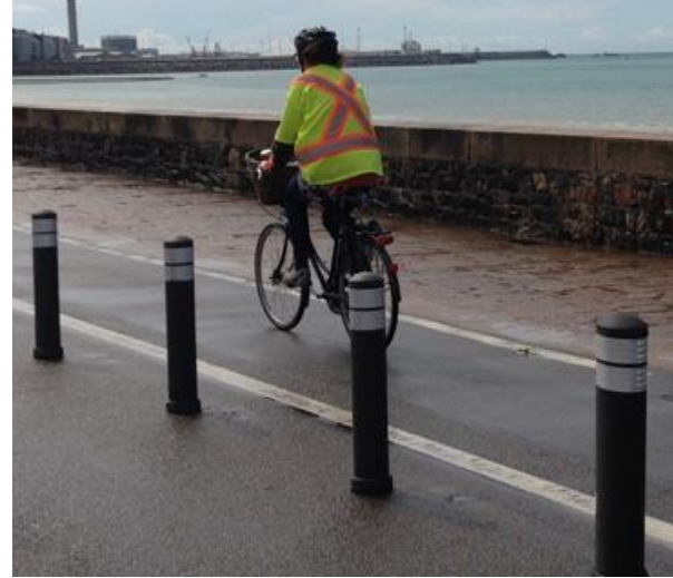
Figure 17: delineator bollards not placed on a lane line