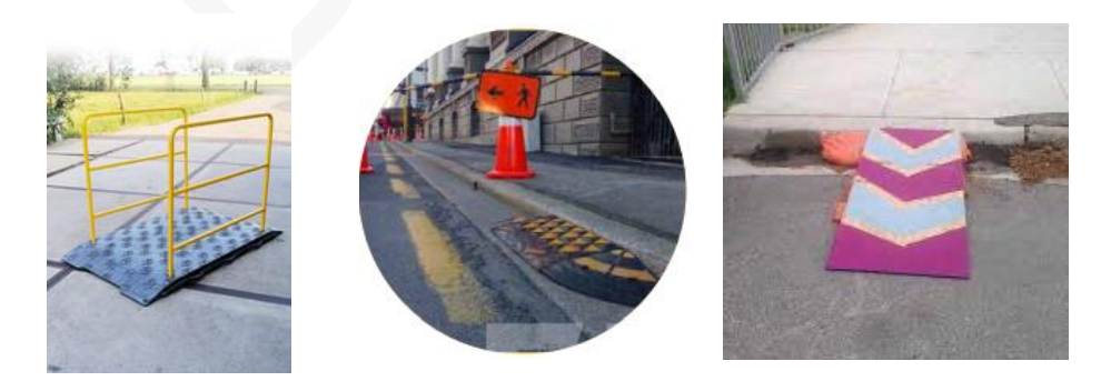
Figure 22: temporary ramps may be made of rubber, wood or asphalt (latter not pictured); must be slip resistant