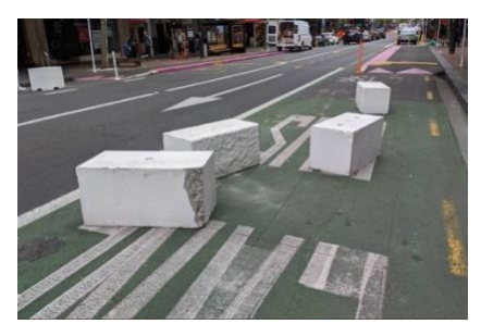
Figure 4: concrete separators dislodged, Auckland

Some devices have a 100 mm metal threaded pin and socket (Figure 5) that is epoxy glued into the ground, allowing for temporary or permanent application. Permanent application methods such as gluing or bitumen fixing directly to the ground or expanding wedge bolts may cause more damage resulting in water penetration; removal will likely require repairs to seal. This may be acceptable if the benefits of the project outweigh the repair costs.