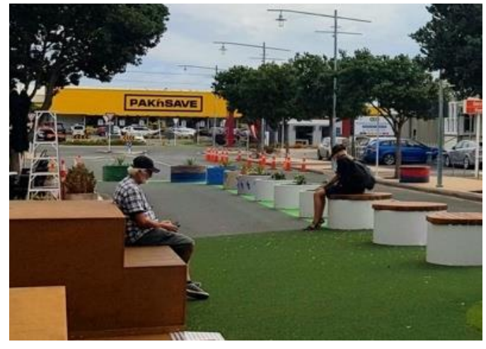
Figure 10: barrel delineators used for seating and a 'modal filter', Thames (Thames-Coromandel District Council)