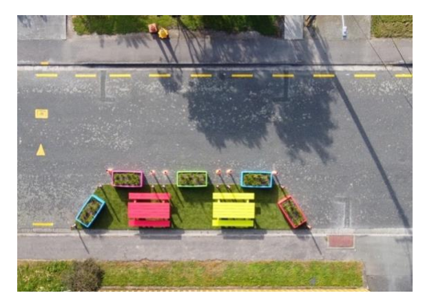
Figure 14: posts and planters kerb extension (Nelson City Council)

Low plastic armadillos lane delineators (Figure 15) and other similar devices should be carefully considered – they may be trip hazards for pedestrians and can cause a loss of control for people cycling. If used, they should have high visual contrast and consideration for pedestrian desire lines.