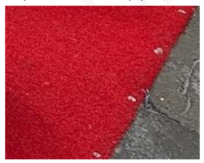
Figure 33: glue and screws used on asphalt provides for heavy skateboard and pedestrian traffic, Nelson

Figure 32: synthetic turf transforms a former vehicular space into a central city playground, Nelson