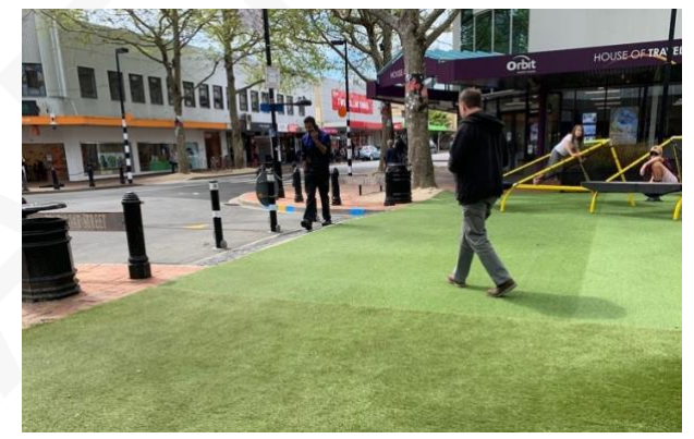
Figure 31: synthetic turf and blue paint transform a former carpark at the Riverside Youth Pop-Up Park, Nelson