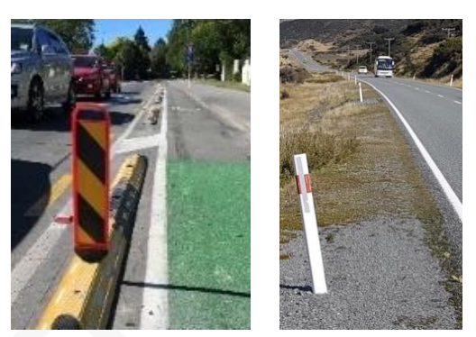
Figure 7: incorrectFigure 8: edge markercolours for this usepost (G. Koorey)

Edge marker posts (Figure 8) are only to be used on rural roads; they are not delineator posts and are not appropriate for tactical urbanism projects.