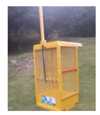
Figure 35: temporary lights (L to R) - overhead pole, concrete base mount (Auckland), cage mount (Tauranga)