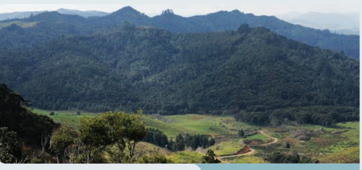
Taupiri Scientific Reserve

Mitigation will also include incorporating of some of the land severance areas to the east of the Expressway into the Taupiri Scientific Reserve as well as protecting other areas of ecological value by measures such as conservation covenants.