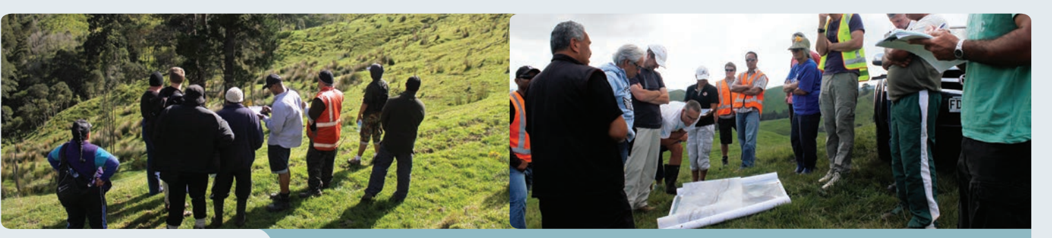
NZ Transport Agency consultants discuss the Huntly Section with Tangata Whenua Working Group members

"The Transport Agency has benefited from the working group by gaining a clear understanding of our concerns and ideas. We look forward to maintaining the excellent relationship as the project now moves from the investigation and design stage into construction and beyond."