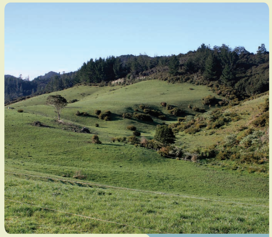
Planned Gun Club site on Evans Road

The Evans Road property was purchased by the Crown in 2008 for this specific purpose.