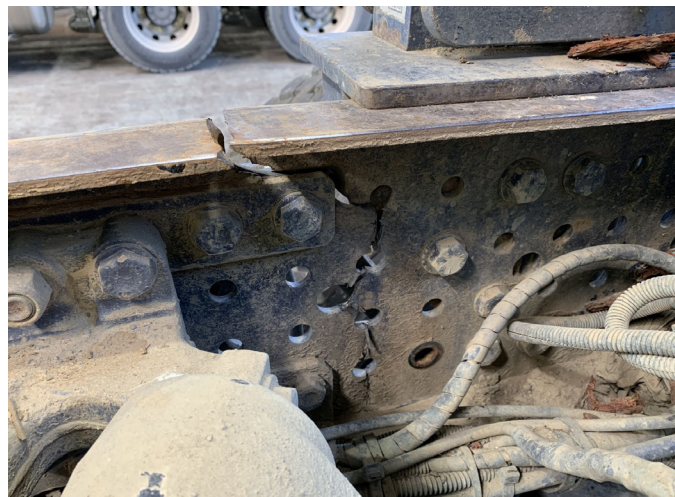
Figure 1: Cracked chassis rail

Two instances of cracked chassis rails in logging trucks have been reported to Waka Kotahi. In both cases, a crack developed between the rear suspension hanger and the log bolster attachment (Figure 1).