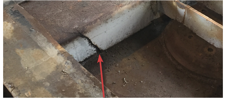
Structural cracks on a cross-member in the skid plate / king pin assembly of a refrigerated trailer (found after the flooring was removed to reveal an internal chamber).

Several ports are needed to allow inspections in each separate chamber (separated by welded-in reinforcements). The trailer manufacturer will provide specific instructions on where the inspection ports are to be located.