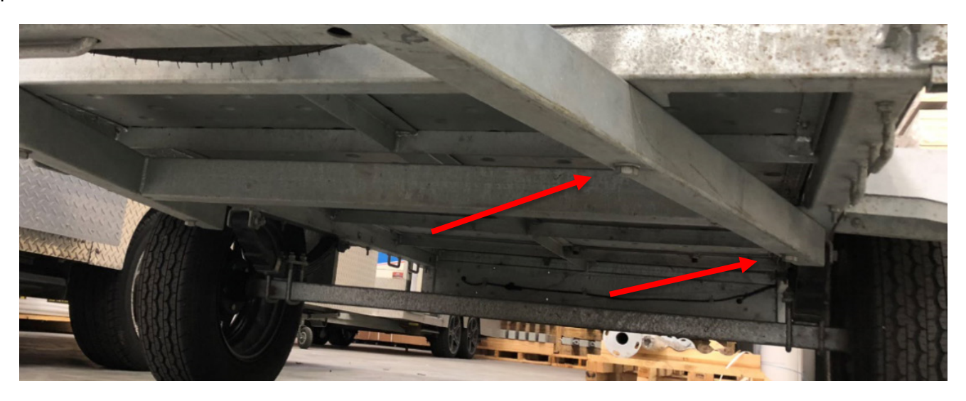
Trailpro TP5 and TP8 models have drawbars bolted to the trailer

If the identification plate is missing, damaged or obscured you can also identify the Trailpro models TP5 and TP8 as their <u>drawbars are bolted rather than welded</u> to the trailer. See an example of this in the photo below.