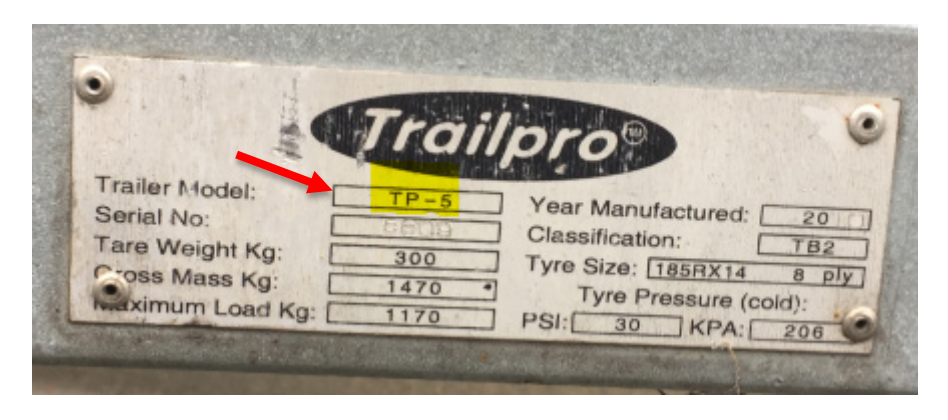
Trailer model number is shown on the identification plate

If the identification plate is missing, damaged or obscured you can also identify the Trailpro models TP5 and TP8 as their <u>drawbars are bolted rather than welded</u> to the trailer. See an example of this in the photo below.