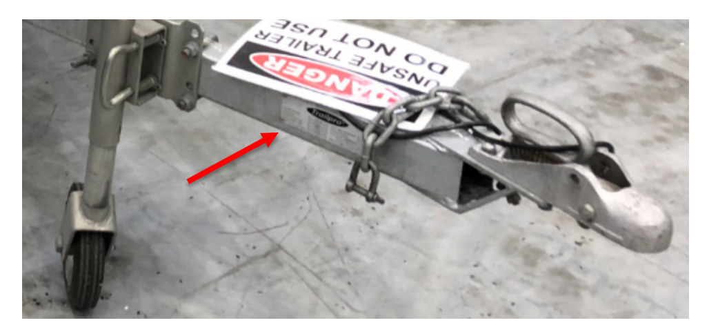
Location of trailer identification plate