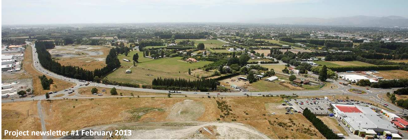
Aerial photograph of Johns Road. The Harewood Road roundabout is to the right of the photograph.

As part of NZTA's on-going State Highway 1 improvements, City Care will be upgrading Johns Road between Sawyers Arms Road and Harewood Road. Work begun in January 2013 and will take approximately 12 months to complete.