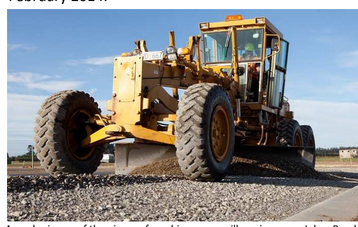
A grader is one of the pieces of machinery you will see in use on Johns Road

We anticipate this project will be completed by February 2014.