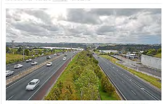
Construction of the Northern Busway Extension will be complete by 2021.

North Shore Times 19 Jul 2015 +1 more TOM DILLANE