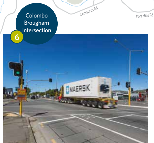
6 Colombo Brougham Intersection