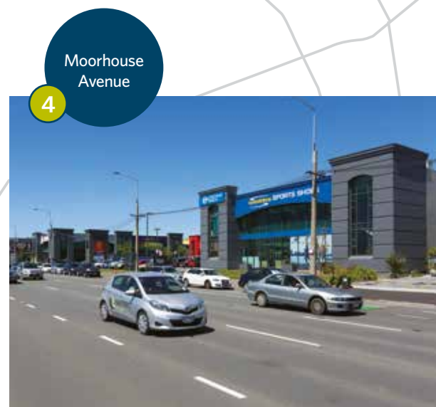
4 Moorhouse Avenue