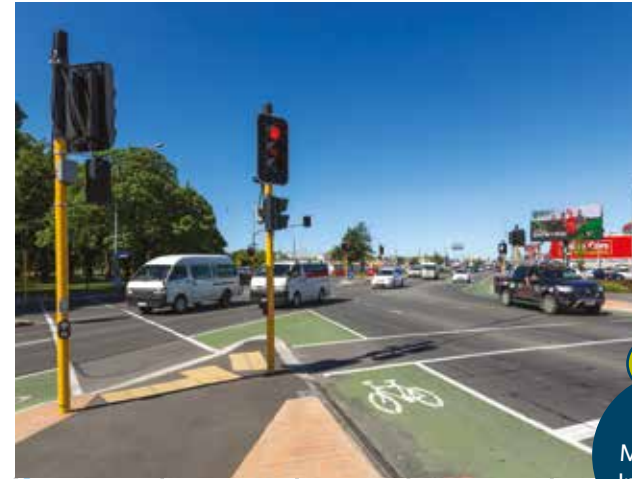
1 Lincoln/ Moorhouse Intersection

Your local knowledge will be used to help develop short, medium and long term improvements that will make it safer and easier to get around.