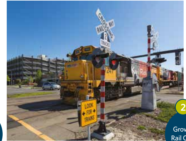
2 Grove Road Rail Crossing