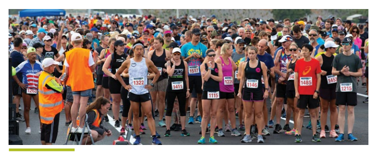
On your marks for the Expressway Classic races

The lagoon site was repurposed to accommodate the public from early on the following day. Around 1700 took part in the Expressway Classic half-marathon and shorter running and walking events before the public arrived to explore the site on foot, bike or in a free bus.