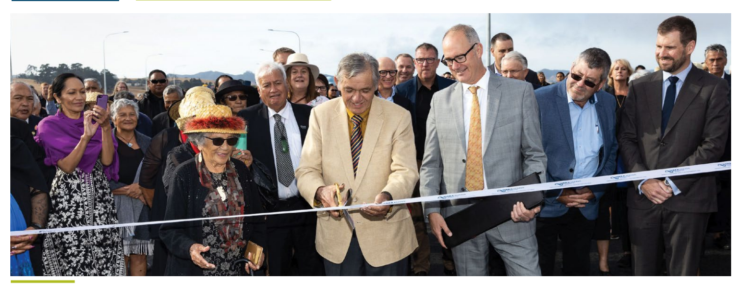
At the end of the blessing event, Maori KingTuheitia cuts the ribbon, with Transport Minister Phil Twyford at his side.