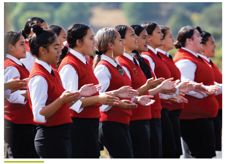
The pupils from Rakaumanga School in Huntly helped at lunch and also provided the entertainment.