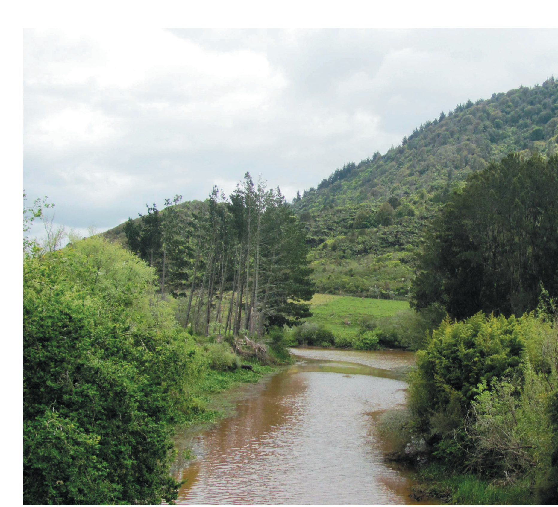
Mangawara inlet and Taupiri Maunga