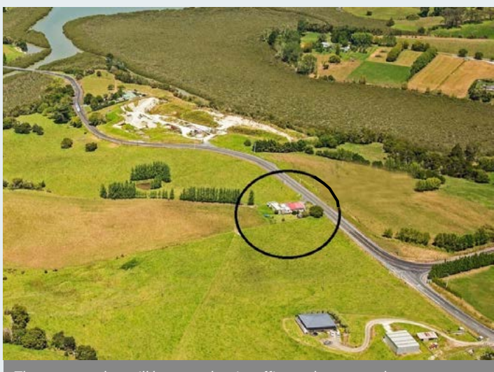
The property that will become the site office and compound

SAPs will be among the first things to be built for the project and eventually there will be 9 of them throughout the site.