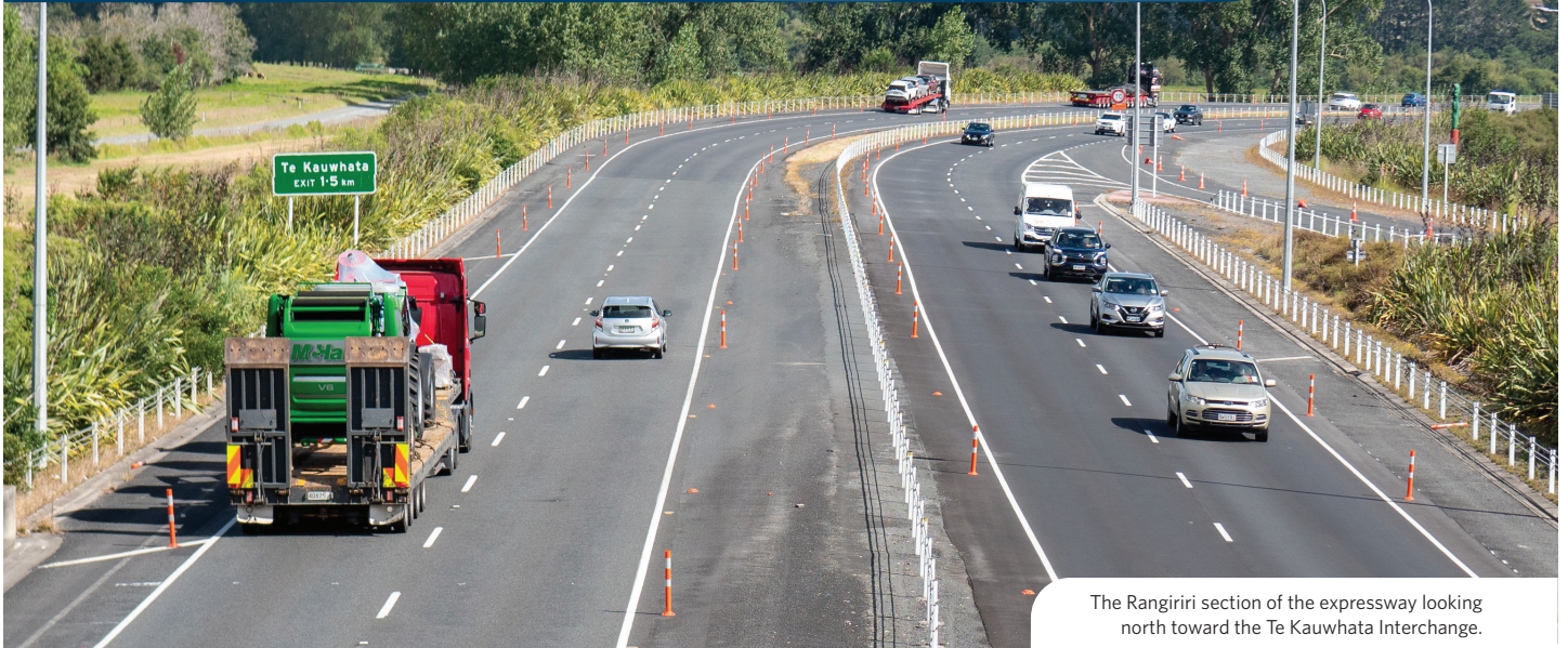
The Rangiriri section of the expressway looking north toward the Te Kauwhata Interchange.