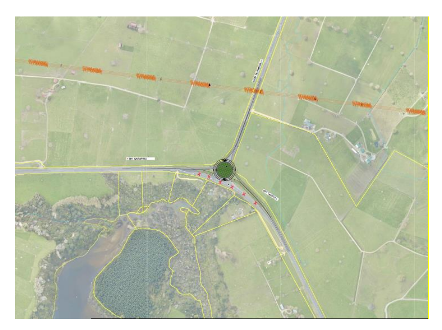
Figure 1: Option A – Roundabout Option in location of existing intersection

21.2 Option B – Discounted for the same reasons as Option A plus impacts on property. I also note Option B would be closer to the tributary to Lake Karapiro, and would likely encroach on the gully area to the south of SH1, which is identified as bat habitat.