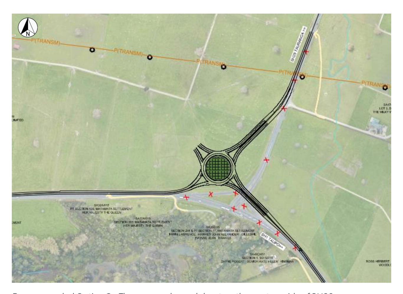
Recommended Option C - The proposed roundabout on the western side of SH29