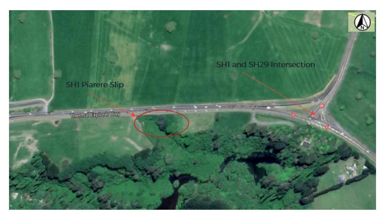
Figure 5-3: SH1 Piarere Slip - location of known instability

As such, this option was discarded prior to the MCA assessments.