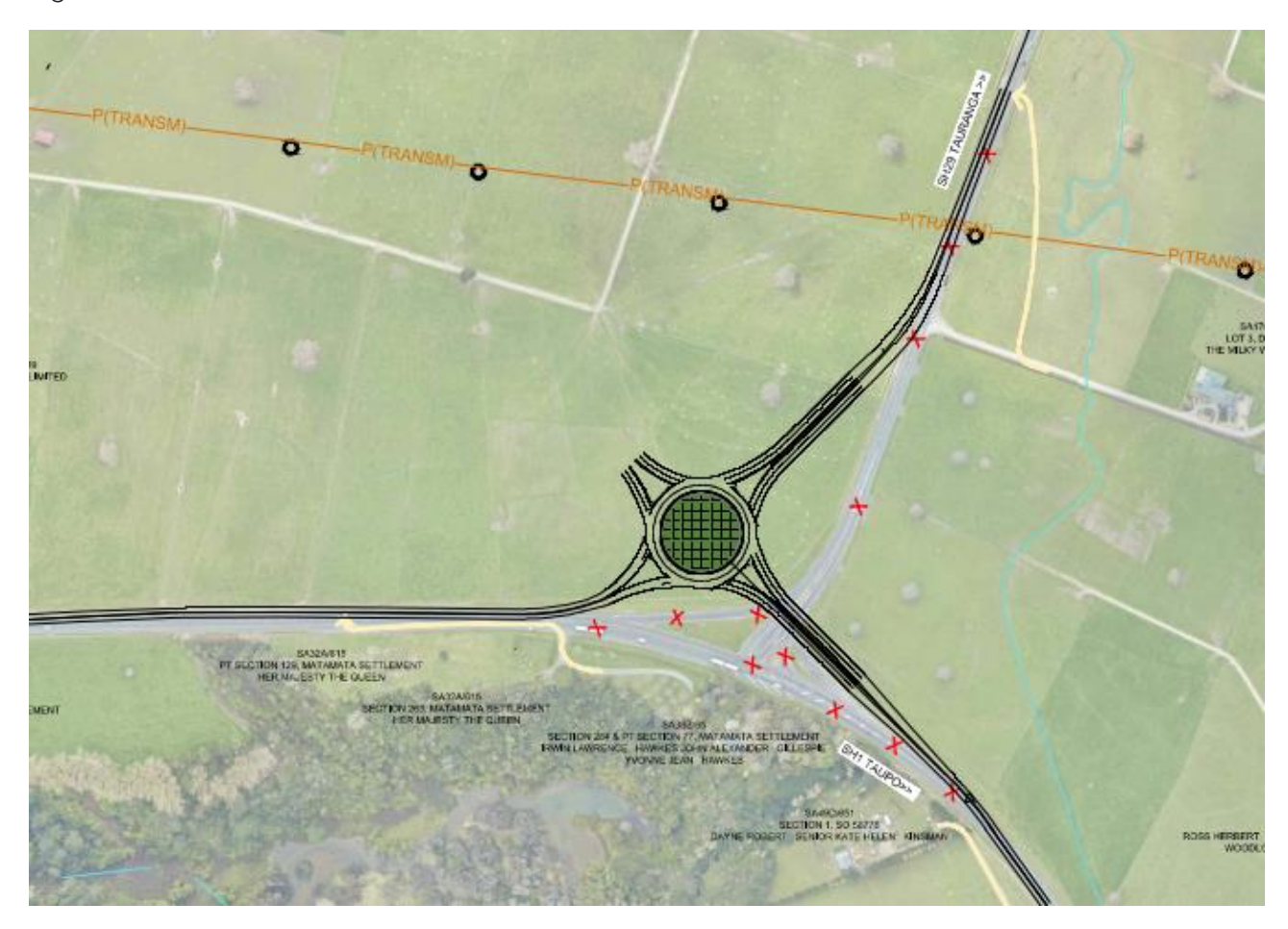
Figure 5-1: Option C - The proposed roundabout on the western side of SH29

Option C is to locate the roundabout to the north of SH1 and to the west of SH29 as illustrated in Figure 5-1.