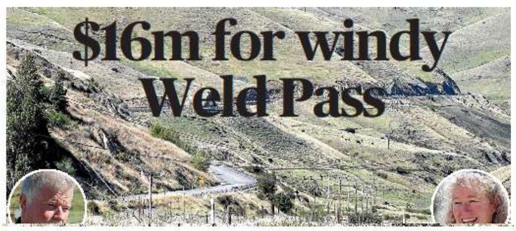
Freight, workers, locals and tourists use the notoriously windy Weld Pass every day