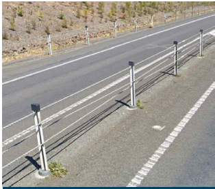
Median barrier example