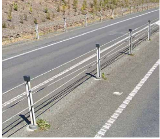
Median barrier example