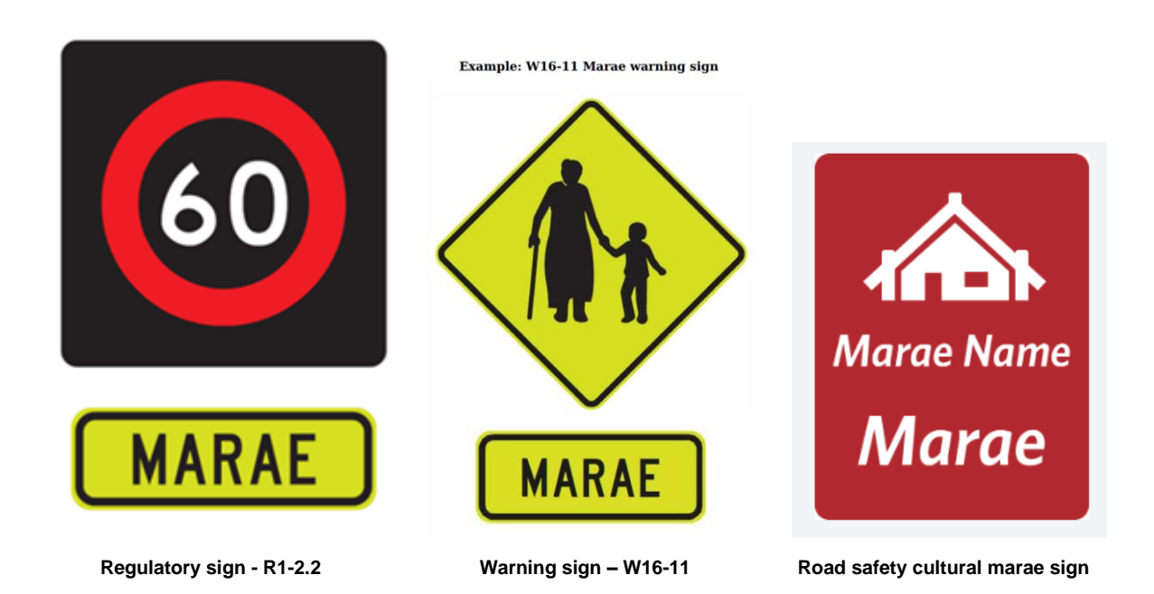
Figure 1: Marae signage

The available signs consist of three types of signage: