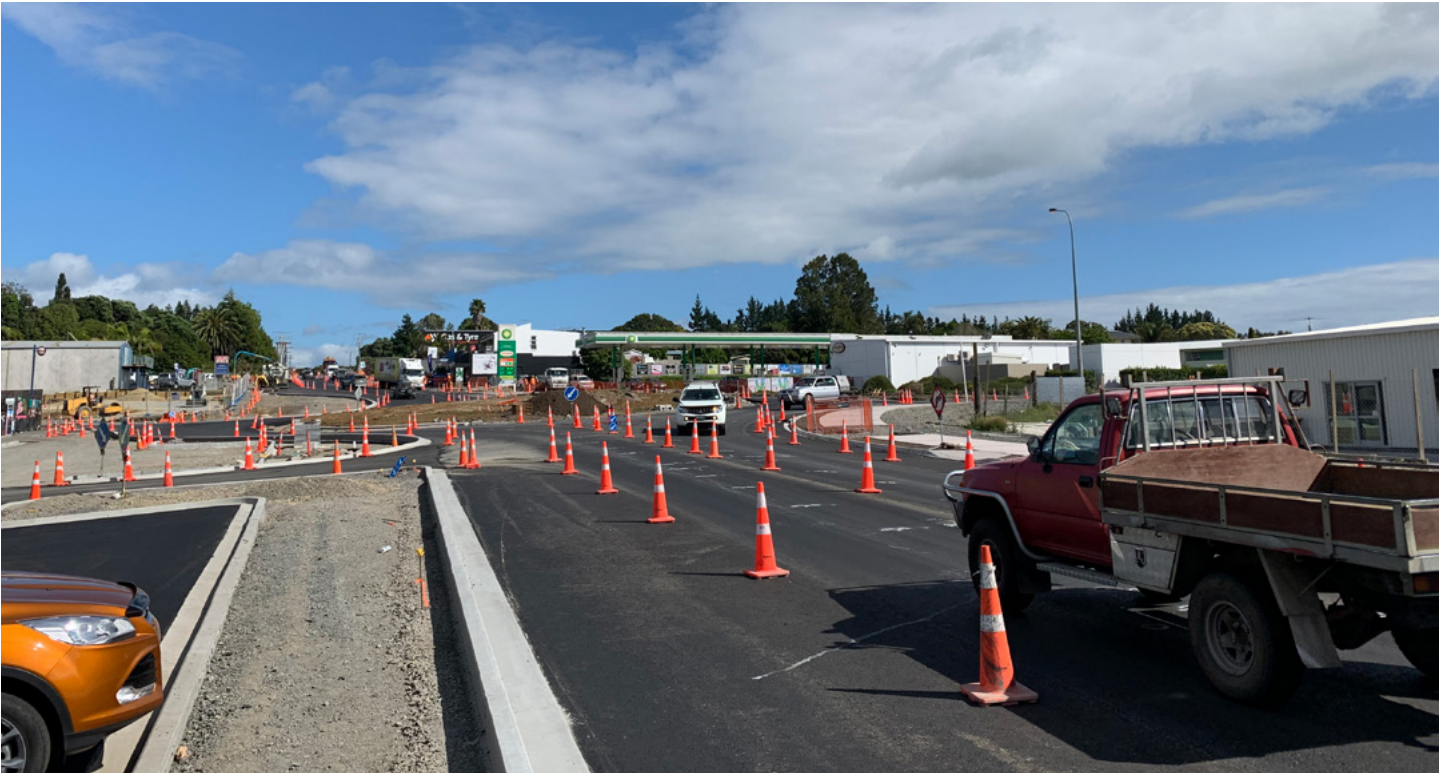
State Highway 10 with asphalt

Construction is well underway on the SH10 Waipapa Corridor Improvements project. The roundabout has been in place since October and is functioning well.