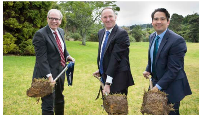
From left to right; Auckland Mayor Len Brown, Prime Minister John Key and Minister of Transport Simon Bridges turning the Sod at Lowtherhurst Reserve, Massey, Friday 8th July 2016.

Hawkins Infrastructure has been awarded the $100 million contract to complete the upgrade. Hawkins is a leader in delivering infrastructure projects in New Zealand.