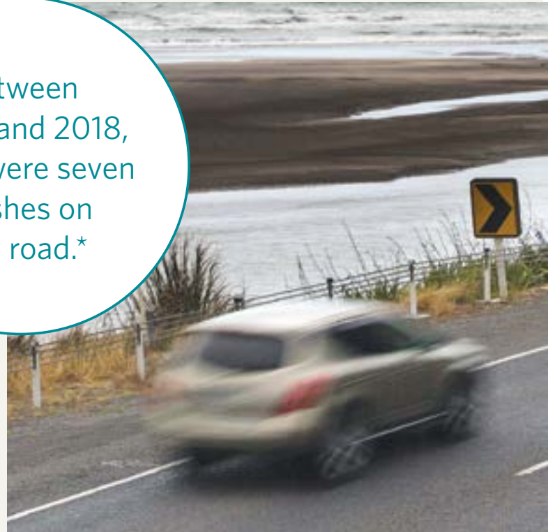
*2018 data is not yet complete. Data is for crashes as recorded in CAS at 31/07/2019.

Public consultation is a requirement under the Land Transport Rule: Setting of Speed Limits (2017).