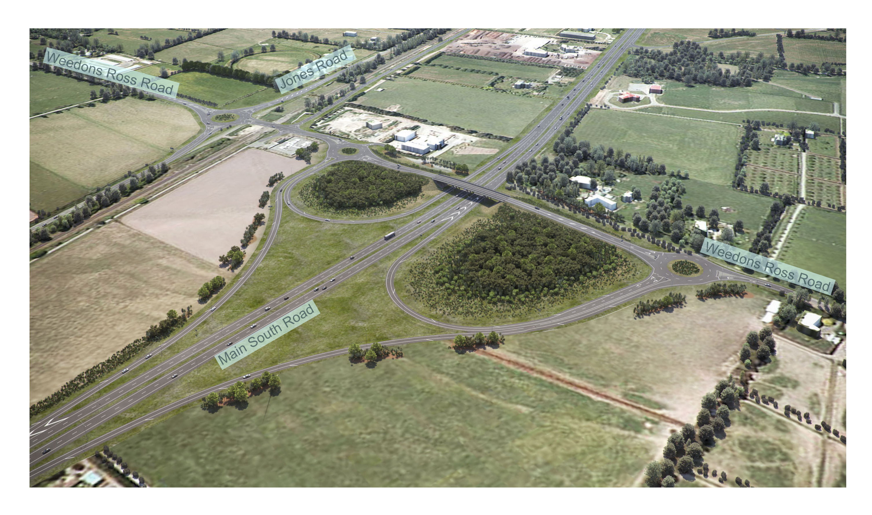
Landscape Character Area 1 Photomontage 1. MSRFL Weedons Road Interchange