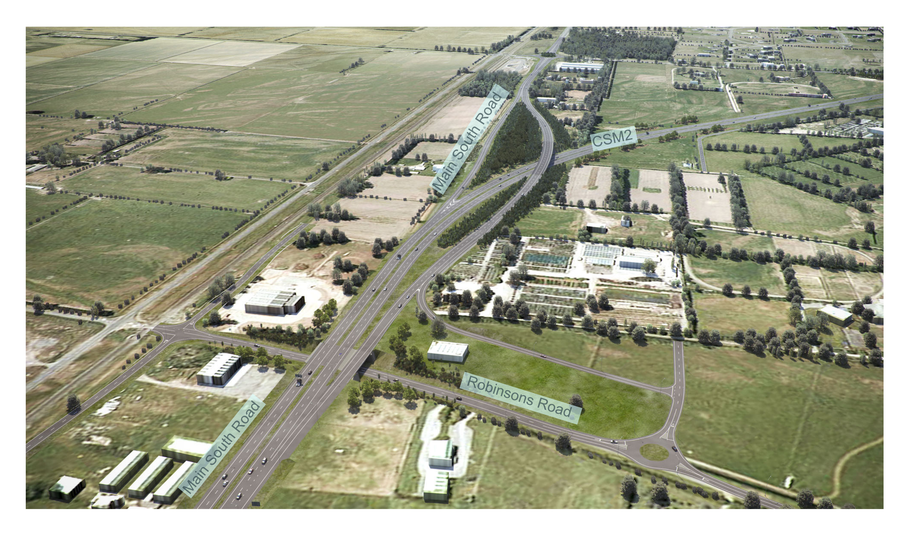
Landscape Character Area 2 Photomontage 2. CSM2 and MSRFL Interchange at Robinsons Road