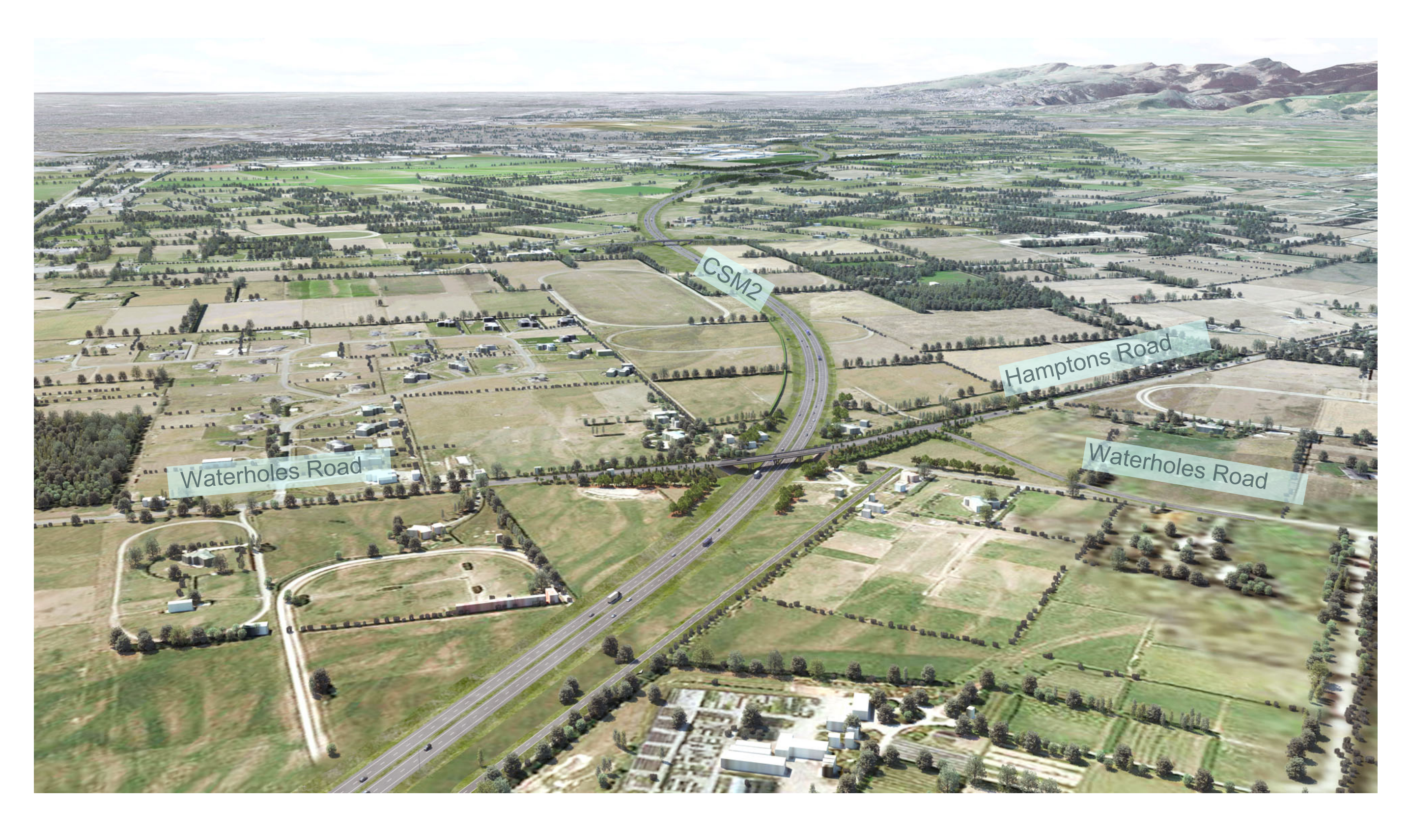
Landscape Character Area 2 & 3 Photomontage 3. Waterholes Road Overbridge (looking north) Please Note: Detailed landscaping to either side of the CSM2 is not shown in this photomontage.