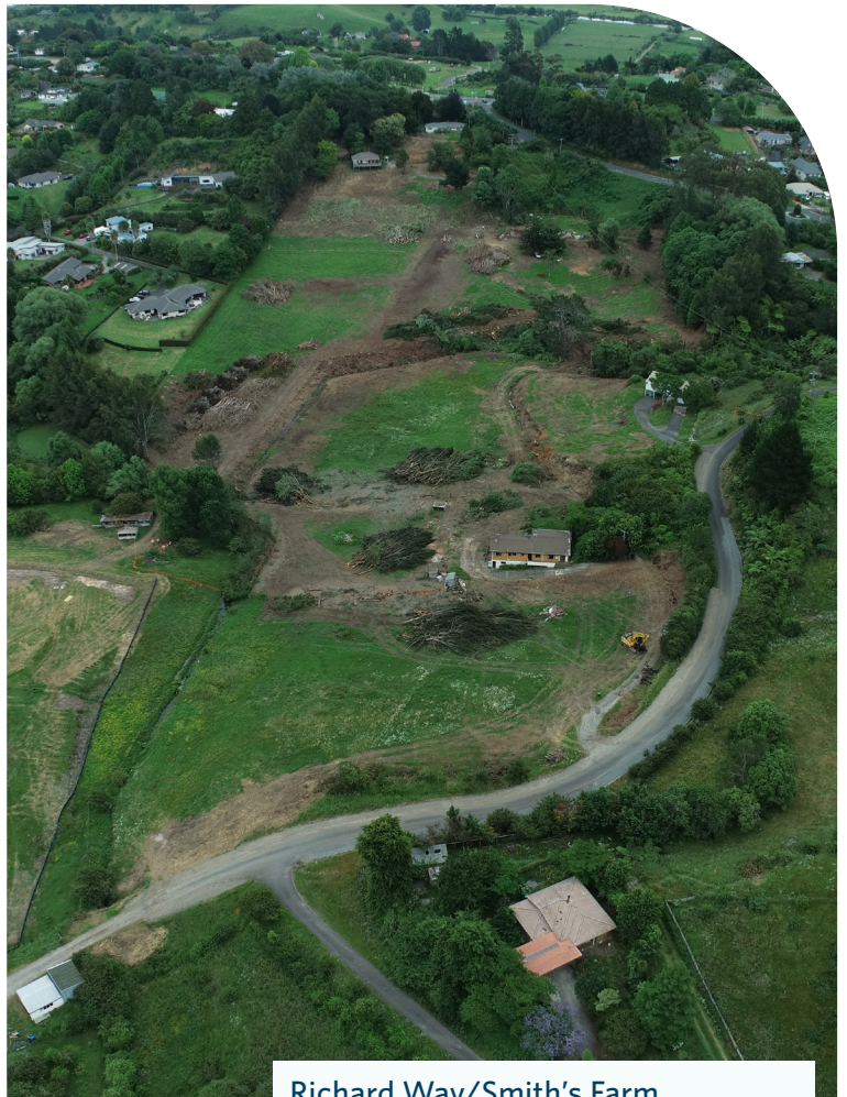
Richard Way/Smith's Farm December 2021 and November 2022

E koa ana mātou ki te whakaatu i ngā whakaahua ki tēnei pānuitanga o ngā kokenga nui ahakoa koinei te takurua mākū tuarua rawa i te rohe nei.