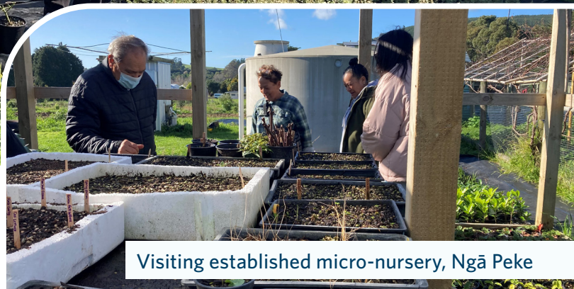
Visiting established micro-nursery, Ngā Peke

With the protection of te taiao the priority for tāngata whenua, materials are being re-purposed and used to construct new micro-nursery shade houses for growing seedlings. The re-purposing of materials aligns with the project's environmental and sustainability kaupapa.