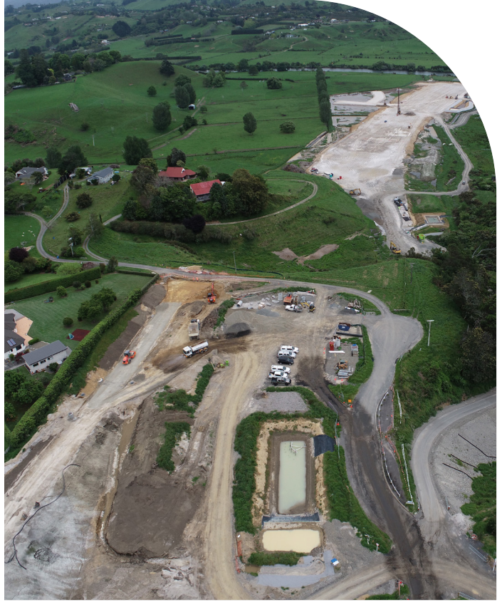
Photo taken from Wairoa Road looking east towards the river - December 2021 and November 2022