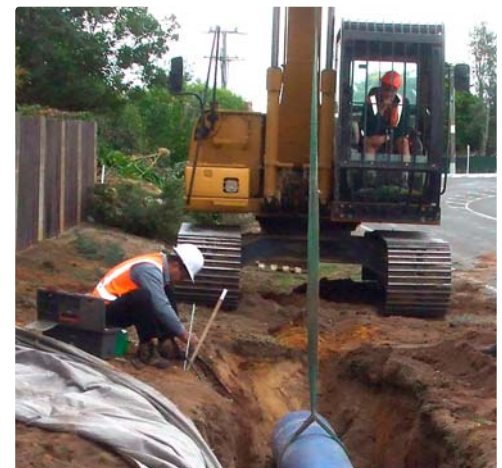
Parton Road enabling works - watermain relocation.

ESTIMATED TOTAL COST: $455 million (in 2010 dollars).