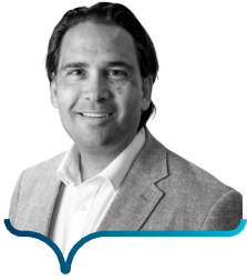
Hon Simon Bridges Chair