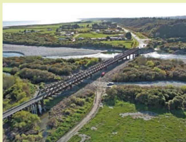
Work will start in the coming year on replacing the aging Arahura road-rail bridge on SH 6 near Hokitika.