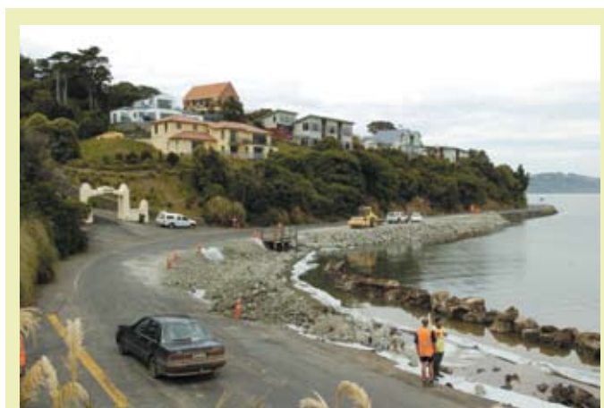
Construction work that will improve walking and cycling facilities on the Portobello-Harrington Point Road near Dunedin.