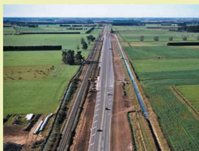
Recently completed passing lanes on SH1 south of Ashburton.