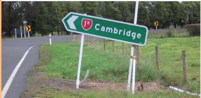
Significant damage but still legible in accordance with MOTSAM