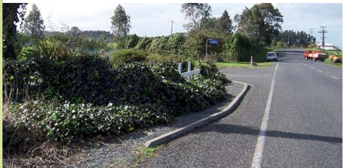
Growth has almost totally obscured structure