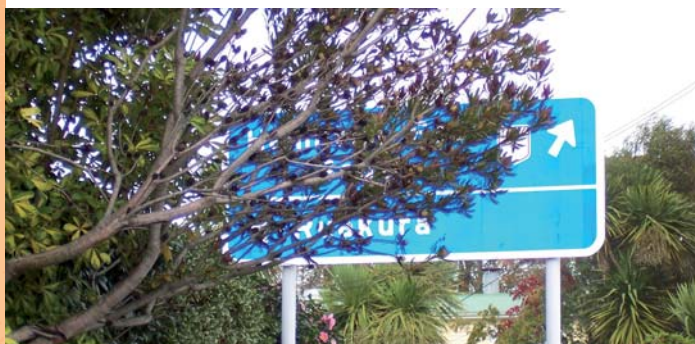
Dirt or vegetation obscures the sign and it is not legible