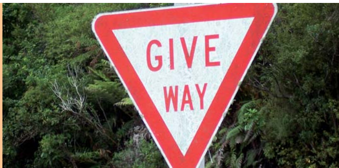
Slightly dirty but still legible in accordance with MOTSAM