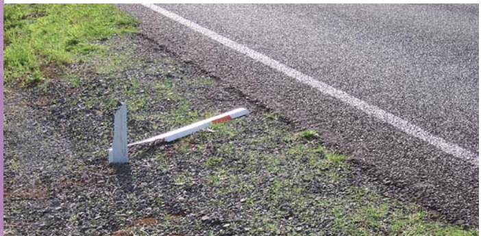
Major damage or knocked down