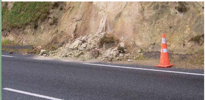
Loose material over edgeline