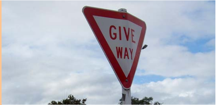
Minor damage but still legible in accordance with MOTSAM