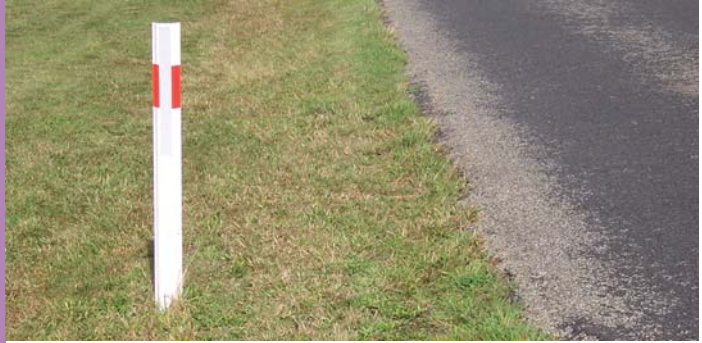
No damage - intact