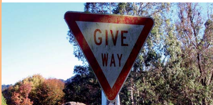
Obscured by dirt or vegetation with minor effect of the legibility