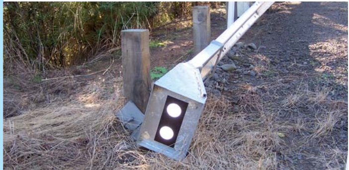
Minor damage and not operating as designed