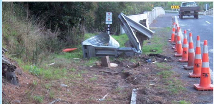
Major damage and not functioning