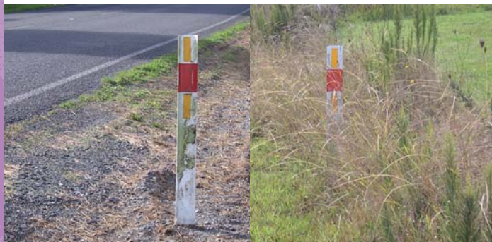
Dirty or vegetation obscures the reflector