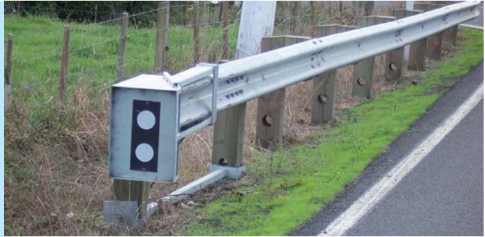
No damage - intact