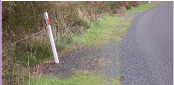
Post positioned slightly out of alignment but does not give false impression of alignment