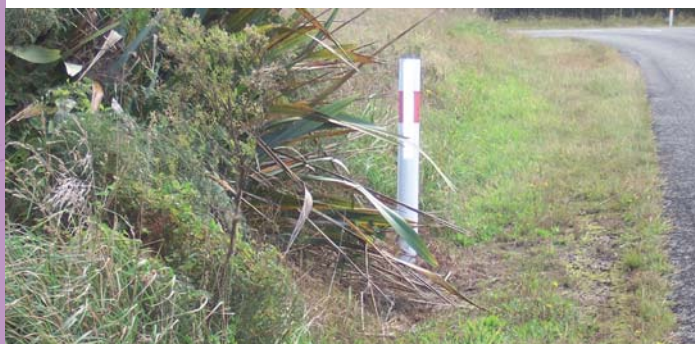
Slightly dirty or vegetation obscures post but does not effect reflector