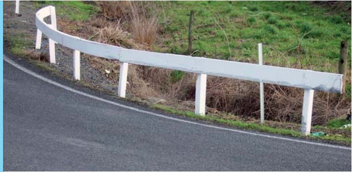
No damage - intact