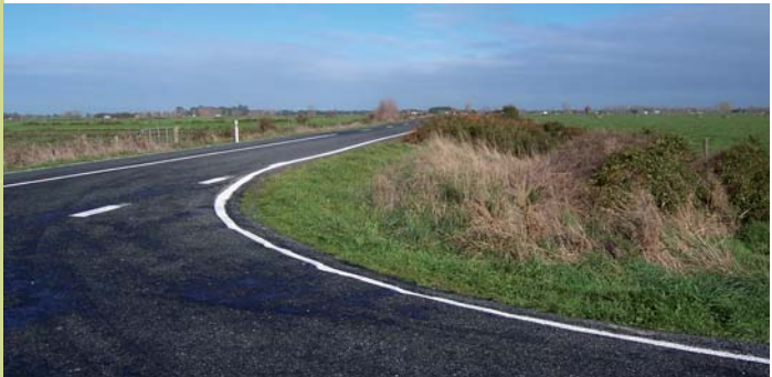
Vegetation getting up to height where with growth the sightline will be obstructed