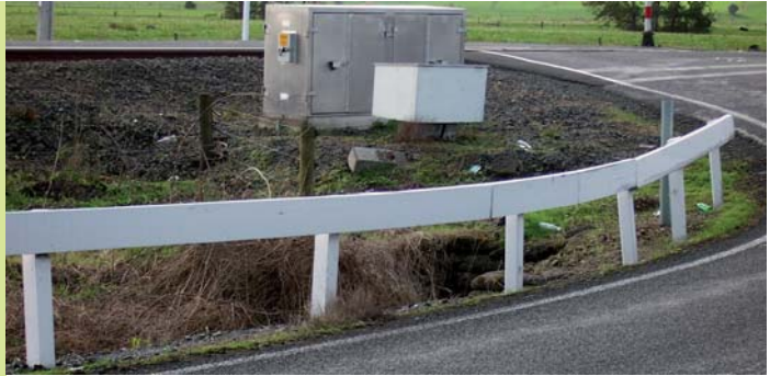
Structure fully visible