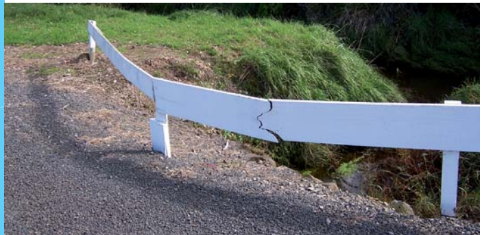
Minor damage but still retains some of its visibility function