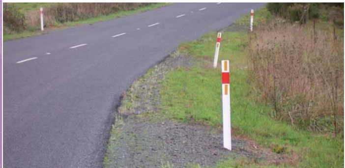
Post in incorrect location or wrong reflectors giving false impression of alignment