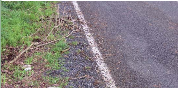
Loose material at edgeline