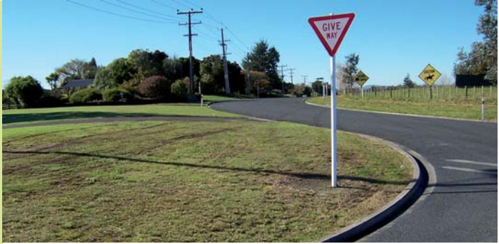
Sight lines not obscured