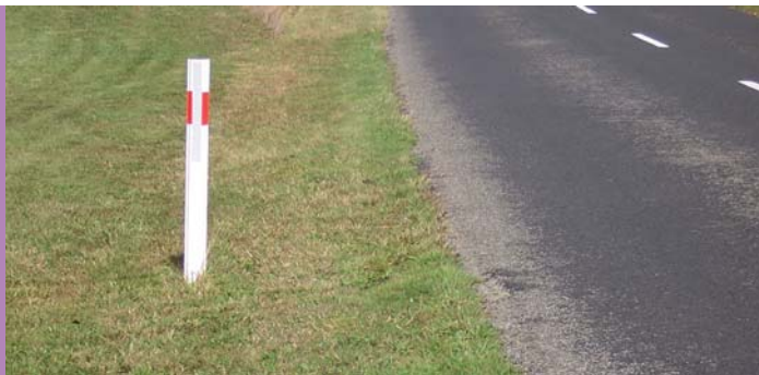
Clean and fully visible