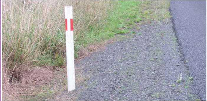
Post at correct height and location