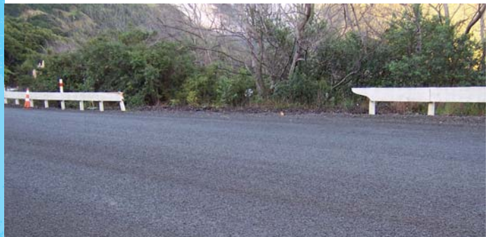
Major damage and does not have any visibility function