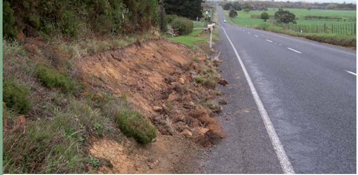
Loose material not over edgeline