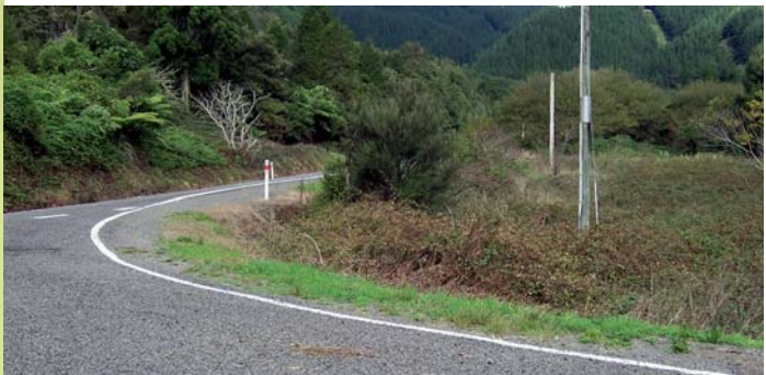
Vegetation obscures sightlines