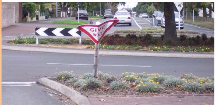
Damaged and illegible in accordance with MOTSAM