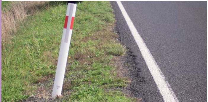
Slight damage or on lean but still functions