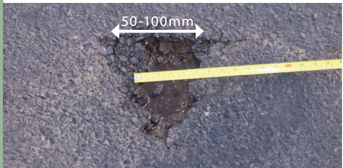
50mm & <100mm diameter