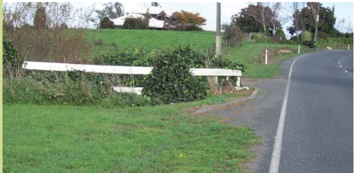
Some growth but majority of structure visible